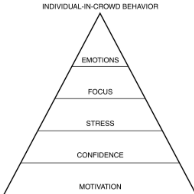
Figure 3. Potential points of intervention for control of individuals.