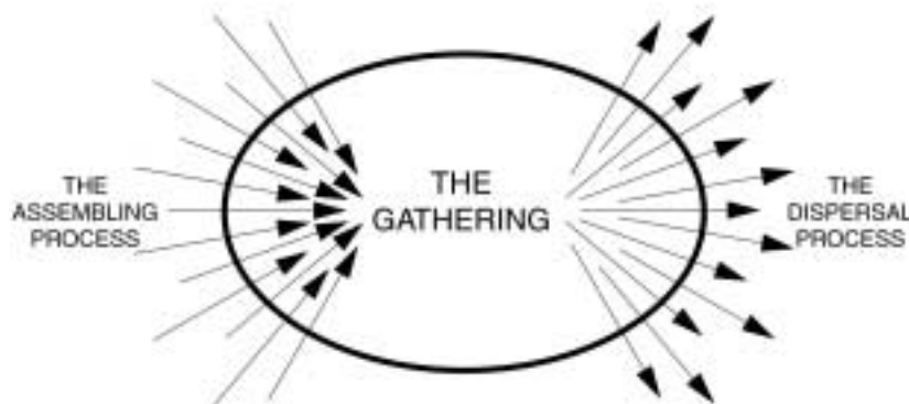
Figure 1. The phases of a gathering. Gatherings have three phases; an assembling process, the temporary gathering, and a dispersing process.

Such gatherings are really more of a process. They have a beginning, middle and an ending phase. This process is reflected in the chart below.