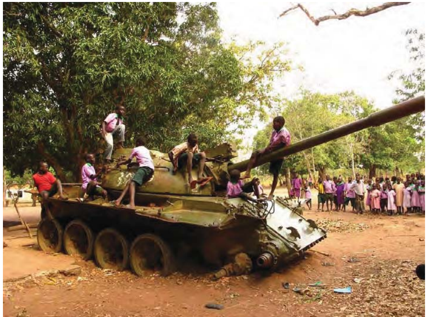
School children play on an abandoned tank, Mundri, Western Equatoria. 15 December 2009

With concerted and immediate action, the parties to the CPA and the international community can, and must, prevent a return to a devastating conflict. Now is the time to bring desperately needed security and assistance to the people of southern Sudan, and to build the foundation for sustainable development and, ultimately, a durable peace.