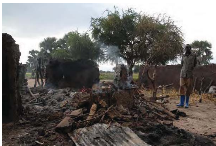
A burnt home in the aftermath of a raid, Duk Padiet, Jonglei state

Five years since the signing of the CPA, southern Sudan is experiencing a major upsurge in violence. In 2009, 2,500 people were killed and more than 350,000 displaced. 4 Despite efforts by the GoSS to contain insecurity as well as the presence of a UN peacekeeping mission, ordinary people, among them women, children, and the elderly, are being killed and abducted in brutal attacks. The insecurity is devastating a highly vulnerable population. Homes, livelihoods, and crops are being destroyed. Five years into the peace agreement, it is unacceptable that civilians are still not being protected from extreme levels of violence.