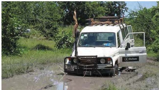
Poor roads on the outskirts of Rumbek, Lakes state. Maya Mailer/Oxfam, 23 September 2009

Source: Oxfam interviews with local government, UN and NGO officials and LRA-affected communities, Yambio, October 2009.