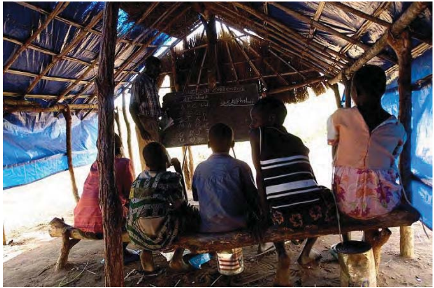
A tent school, Owiny Ki-Bul, Eastern Equatoria state. © Tim McKulka, 26 October 2007

The international community and the GoSS have not delivered significant development to southern Sudan during the critical window of the CPA's interim period. This failure has in turn made communities more vulnerable to disasters. Expanded support to basic service provision through the referendum period and beyond is essential – not only to meeting the current needs of the people of southern Sudan, but in contributing to a sustainable peace.