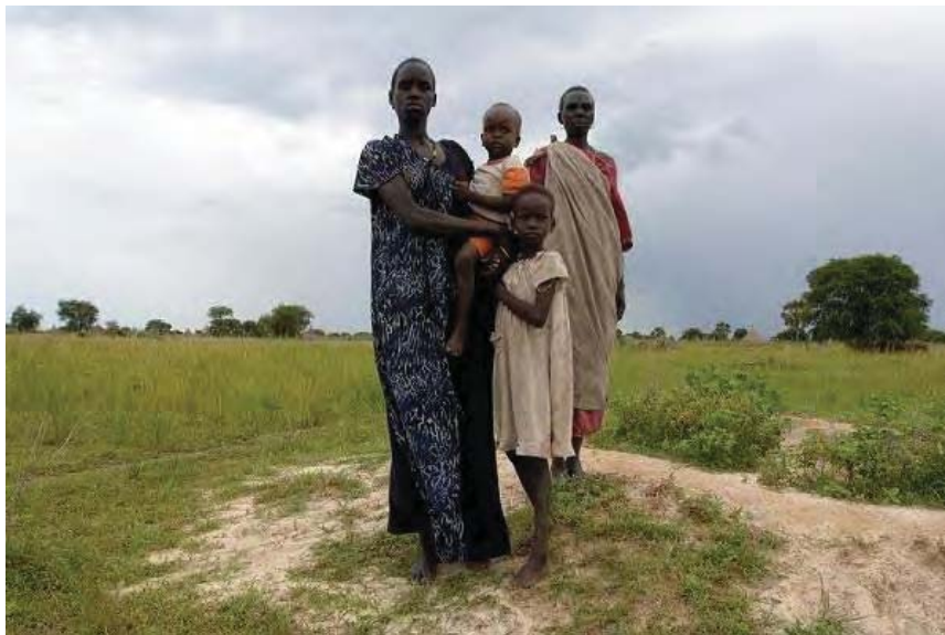
Survivors of an attack in Duk Padiet, Jonglei state

EMBARGOED UNTIL 00:01 HRS GMT 7 January 2010