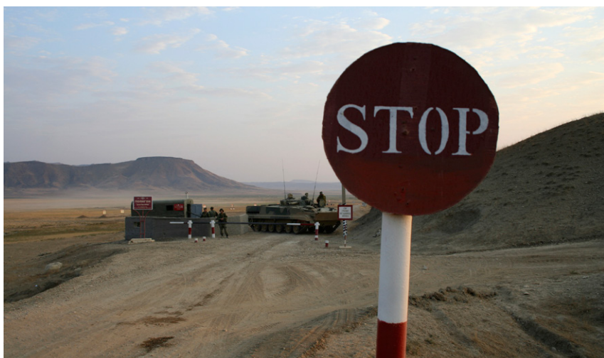
Soldiers stand guard at a check point of a military camp in Dagestan, 5 September 2010

Although Chechnya no longer makes international headlines, instability persists and has actually spread within the wider North Caucasus region. Degrading socio-economic conditions, an unstable political situation, and increasing religious tension have made the North Caucasus susceptible to Islamist insurgency and terrorist activity. The modernisation strategy for the North Caucasus launched by Moscow in 2008 has failed to reverse the situation so far. Turning into an arc of insecurity, the region poses a growing challenge to stability within Russia and beyond.