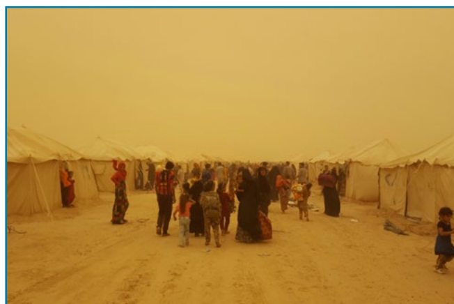
Above: Newly displaced families from Fallujah arrive in camps in Ameriyat al Fallujah.

In the wake of Fallujah, the humanitarian community has faced challenges in meeting the needs of the large influx of IDPs, due in part to bureaucratic barriers and a lack of sufficient preparedness. In order to gain access to Anbar aid agencies must complete a number of procedures, beginning with registration in Baghdad, followed by securing a letter from the Baghdad National Operations Centre in order to operate in Anbar. They must then obtain a facilitation letter for each individual needing to cross the Zbebiz Bridge into Anbar governorate. While the need for a system of registration is clear, the current procedures are time consuming and impact on the ability to respond quickly.