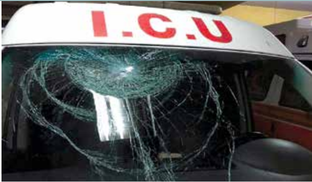
Palestinian ambulance windshield damaged by Israeli security forces' shooting.