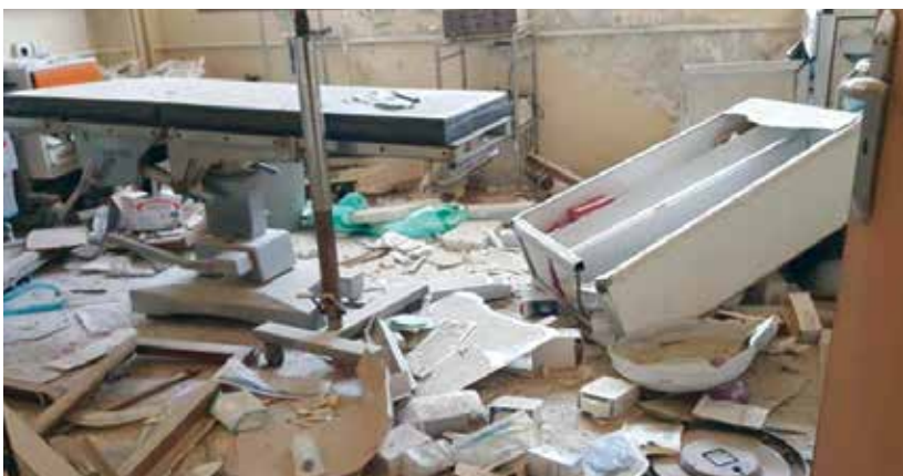
Aftermath of an attack on a SAMS-supported facility in Aleppo, Syria, November 2016.