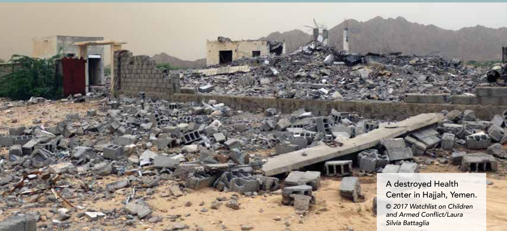
A destroyed Health Center in Hajjah, Yemen.